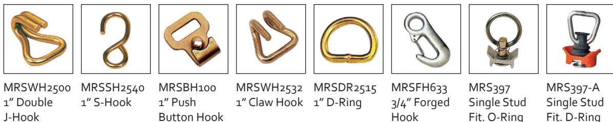
MRSWH2500 1" Double J-Hook