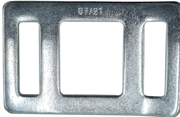
Plate buckle S35P - 30 / 32 mm - 1,700 daN